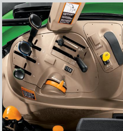
The conveniently located console makes operating the hitch intuitive. Raise and lower the hitch with the control lever and set the stop knob for preset depth.