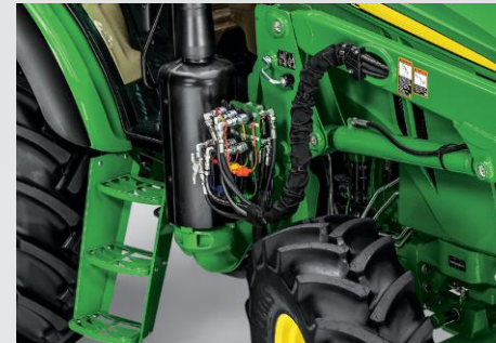
Concealed oil lines improve visibility and protect the hydraulic system from damage.