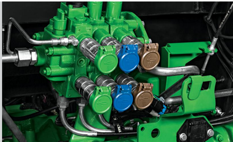
The 6E comes standard with an intuitive hydraulic stack featuring two color-coded and numbered SCVs to make your job easier. An optional third deluxe SCV with flow control is also available.