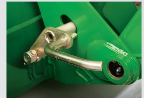
The global carrier – with its single lever for attachments – helps you move from job to job quickly.