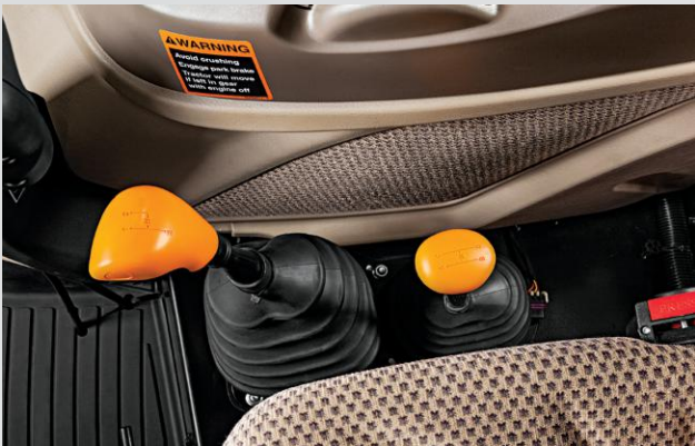
Shift on the fly: Don't stop to change gears. The 6E transmissions are synchrozed when shifting from B to C, C to D and D to C ranges