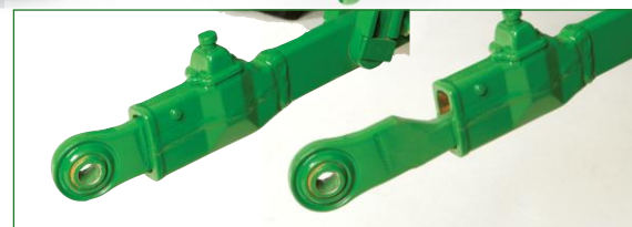
Telescoping draft arms make implement hook up faster and easier.