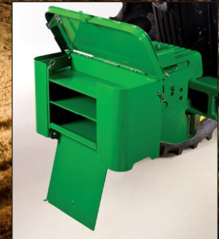
Tractor Utility Box With loads of capacity, two removable shelves and innovative front door and lid design, this new tractor utility box breaks new ground for convenience, versatility and rugged design.