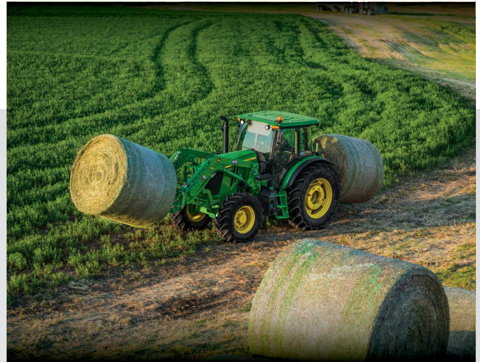
With 3,946 pounds (1789 kg) of lift capacity, an H Series Loader handles round bales ... and can even lift and stack two 5X6 bales easily.