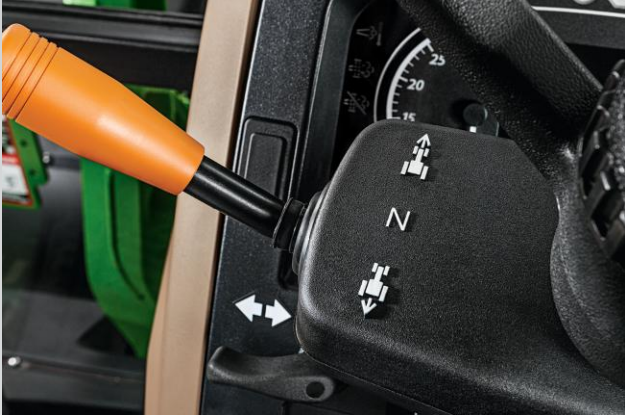
The PowrReverser helps you smoothly change directions without needing to change gears or touch the clutch ... a must have for fast loader work.