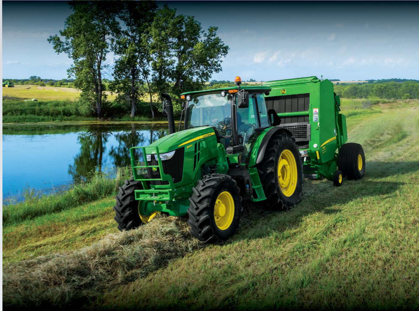
Get 11 speeds in the working range of 5 to 13 miles per hour (8 to 20 km/h) and a top transport speed of 25 mph (40 km/h) with the optional 24/12 transmission.