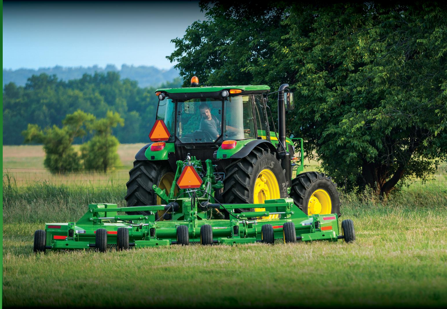
Take on a wide range of PTO-powered jobs with the 540/1000 RPM independent PTO system.

The electrohydraulic engagement system allows you to power the PTO up or down with one simple move. Because the PTO is fully independent, you can handle tough, start-and-stop conditions. It keeps the power flowing whether you're clutching, stopping or changing gears. And switching from 540 to 1000 rpm takes less than 30 seconds, making it easy to handle any implement you've got ... even those requiring higher power within a constant power range.